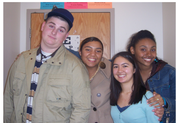
Members of BHSHC's Youth Advisory Board

and Sexual Health Education Now). The two youth groups are responsible for going into classrooms to talk to students about everything from traffic safety and using bicycle helmets, to drunk/drugged driving, and sexual health. These student-led outreach programs have been very effective in getting the word out, and reducing any stigma associated with using the Health Center.